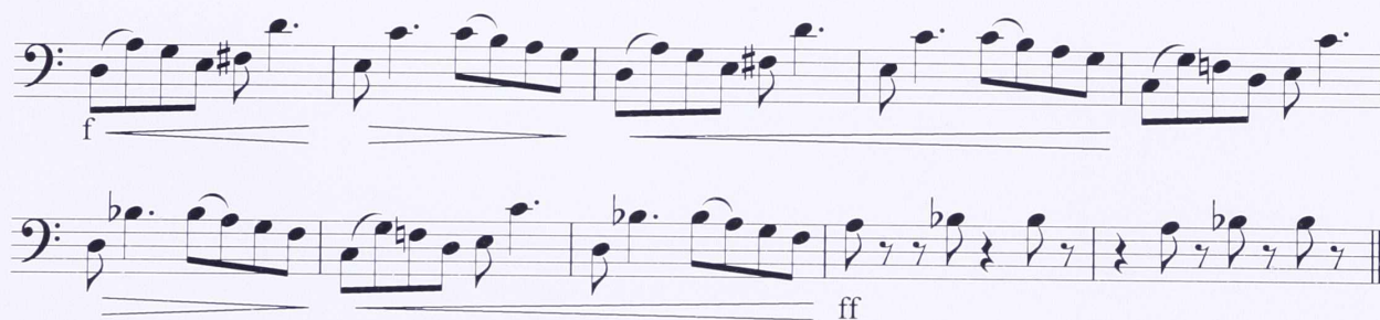
Figure 16. Conductor's Guide, Melodic Phrasing.

The melody is in a range that is not easily projected. When played at the same dynamic level, a whole note will sound louder than a quarter or eighth note. Therefore the six other parts will need to play softer. The melody can be played more intensely as indicated by the dynamic markings. Then with the repeat of the melody in parts three and four in measure 25, the same idea should be repeated. An added challenge becomes apparent, because parts one and two are playing in the upper part of the range which projects very easily. They are also marked a dynamic level louder. This creates the question, which is more important, the restatement of the melody or the new material in the upper two parts? One could argue either way, but clearly one